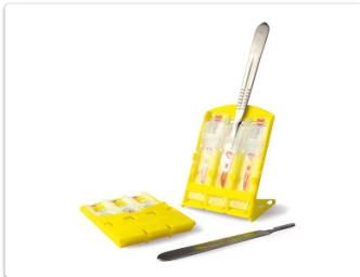
BladeCASSETTE Skip to question 4