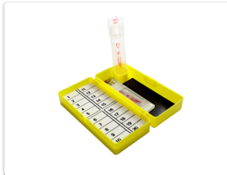
BladeNeedleSYSTEM Skip to question 10