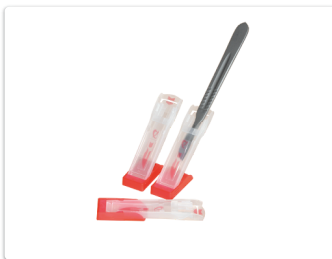
BladeSINGLE Skip to question 16