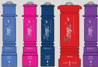
SnapIT and SnapIT Lite Ampoule Openers